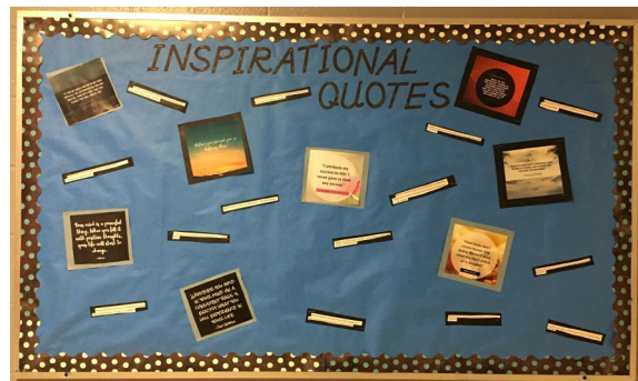
Inspirational quote bulletin board created by JH students

Activity Updates and Tracking - Carbondale Attendance Center and SFT Junior High information and updates are frequently posted to the District FaceBook page and the cac/sftjh Twitter account which can also be accessed from the District FaceBook page.